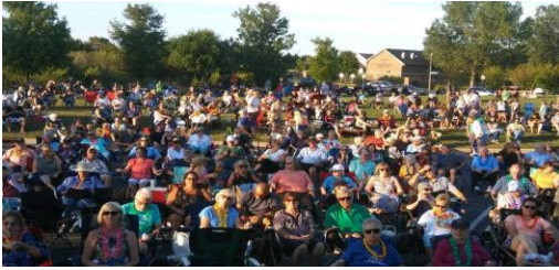
Groovin' in the Grove Summer Concert Series @ the Library

On behalf of the Library Board and Staff we are proud to share the Sugar Grove Public Library's Annual Report, an account of the powerful impact the Library has had serving the community in the last year. We continued to strengthen our community impact with three Gallery exhibitions and new STEM programming. We supported democracy and citizenship as an early voting location. We developed several successful partnerships to launch Indie Author Day, Wintermarket, and the Groovin' in the Grove